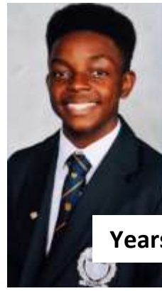
Years 10 & 11