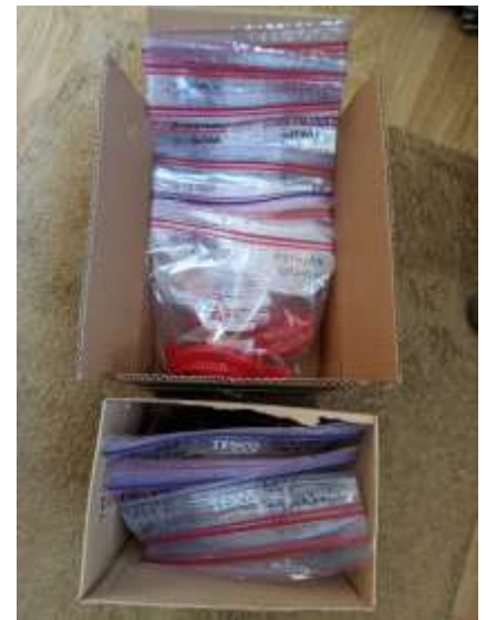
First batch of 170 components ready to be sent for courier collection.