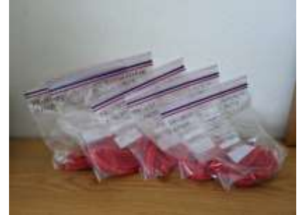
For a batch of ten components, it currently takes me roughly 7 and a half hours to print. I've planned my days into shifts of printing so that I can print as many components as possible every day.