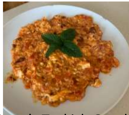
Emre's Turkish Omelette