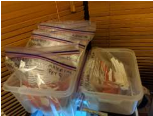
First batch of components during printing.