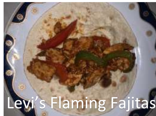
Levi's Flaming Fajitas