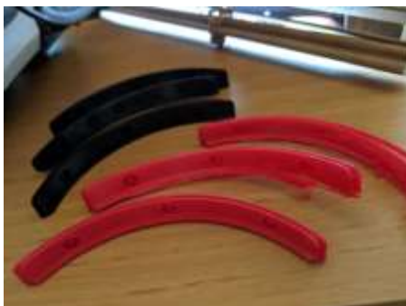
First test pieces & mishaps (Black for bottom section, red for top section).