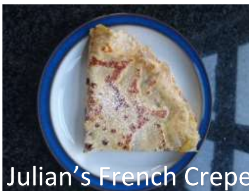
Julian's French Crepe