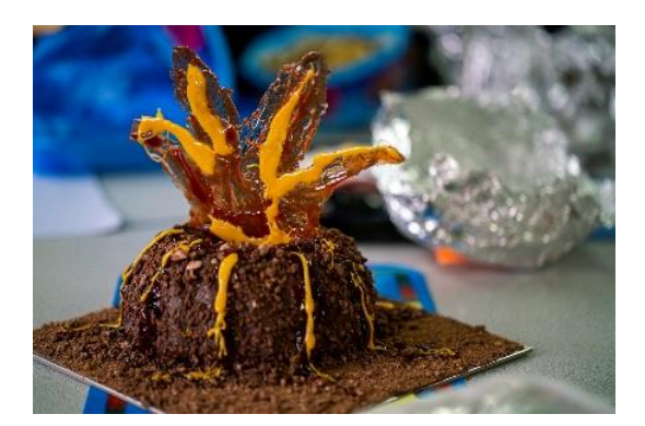
2<sup>nd</sup> place – Louis 10W