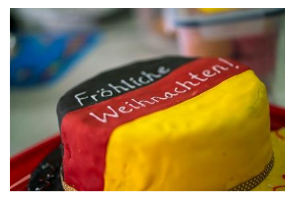
3<sup>rd</sup> place – Akul 8C