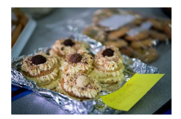
2<sup>nd</sup> place – Darius 8W

Don't forget to follow/like us on our social media accounts